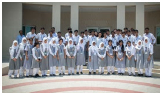
Students from the Indian Public High School, Ras Al Khaimah

We were pleased to welcome several visitors to our headquarters including the Luxembourg Ambassador, students from Fortune Institute Of International Business (India), Indian Public High School, and Palm Beach Atlantic University, SIES College of Management, Swiss Business school, SP Jain School, Gulf Medical Center and Birla Institute of Technology.