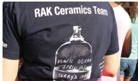
RAK Ceramics Team at Terry Fox Run

RAK Ceramics was proud to take part in the 6th annual RAK Terry Fox Run for Cancer Research at the Al Qawasim Corniche. Over 100 employees took part.