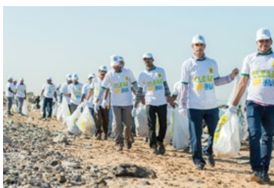
Employees participate in UAE Clean Up Week

RAK Ceramics employees participated in Can Collection Day, organised by the Emirates Environmental Group and collected waste aluminum cans from within the company premises which were then sent for recycling. They also participated in Earth Hour by switching off the lights in its production facilities, employee accommodation buildings and offices for one hour in order to spread awareness amongst its employees of environmental sustainability. RAK Ceramics employees also participated in Earth Day by planting more than 300 trees in campus and also, in World Day for Health & Safety at work with RAK Police to highlight how to avoid accidents in the work place.