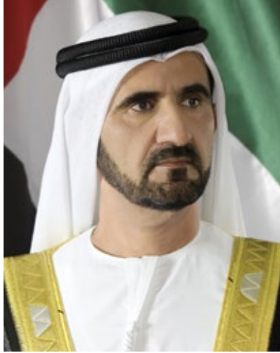
His Highness Sheikh Mohammed Bin Rashid Al Maktoum Vice President and Prime Minister of the United Arab Emirates and Ruler of Dubai