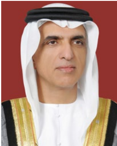
His Highness Sheikh Saud Bin Saqr Al Qasimi Supreme Council Member and Ruler of Ras Al Khaimah