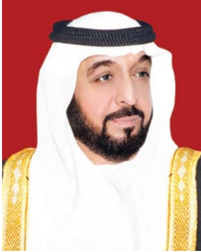
His Highness Sheikh Khalifa Bin Zayed Al Nahyan President of the United Arab Emirates and Ruler of Abu Dhabi