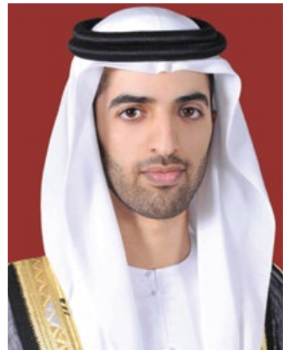
His Highness Sheikh Mohammed Bin Saud Bin Saqr Al Qasimi Crown Prince of Ras Al Khaimah