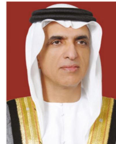
His Highness Sheikh Saud Bin Saqr Al Qasimi Supreme Council Member and Ruler of Ras Al Khaimah