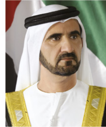
His Highness Sheikh Mohammed Bin Rashid Al Maktoum Vice president, Prime minister, and minister of defence of the United Arab Emirates (UAE) and Ruler of Dubai