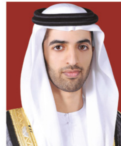
His Highness Sheikh Mohammed Bin Saud Bin Saqr Al Qasimi Crown Prince of Ras Al Khaimah