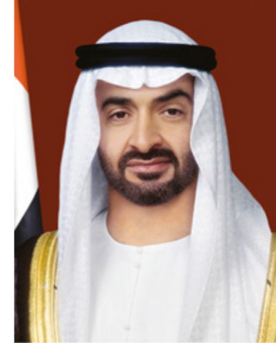
His Highness Sheikh Mohammed bin Zayed Al Nahyan President of the United Arab Emirates and Ruler of Abu Dhabi