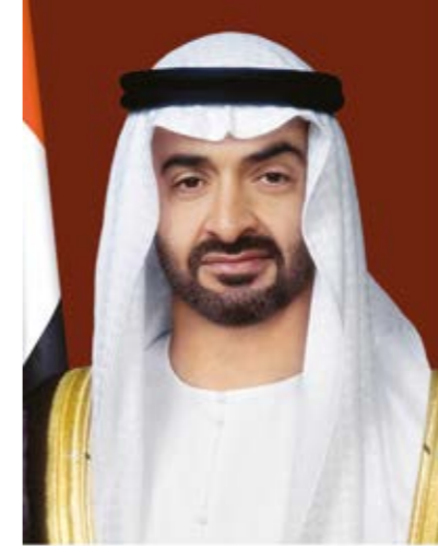
His Highness Sheikh Mohammed Bin Zayed Al Nahyan President of the United Arab Emirates (UAE)