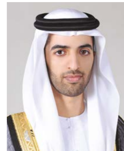
His Highness Sheikh Mohammed Bin Saud Al Qasimi Crown Prince of Ras Al Khaimah