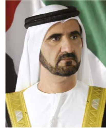
His Highness Sheikh Mohammed Bin Rashid Al Maktoum Vice president and Prime minister of the United Arab Emirates (UAE) and Ruler of Dubai