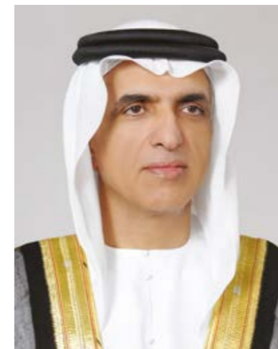
His Highness Sheikh Saud Bin Saqr Bin Mohammed Al Qasimi Supreme Council Member and Ruler of Ras Al Khaimah